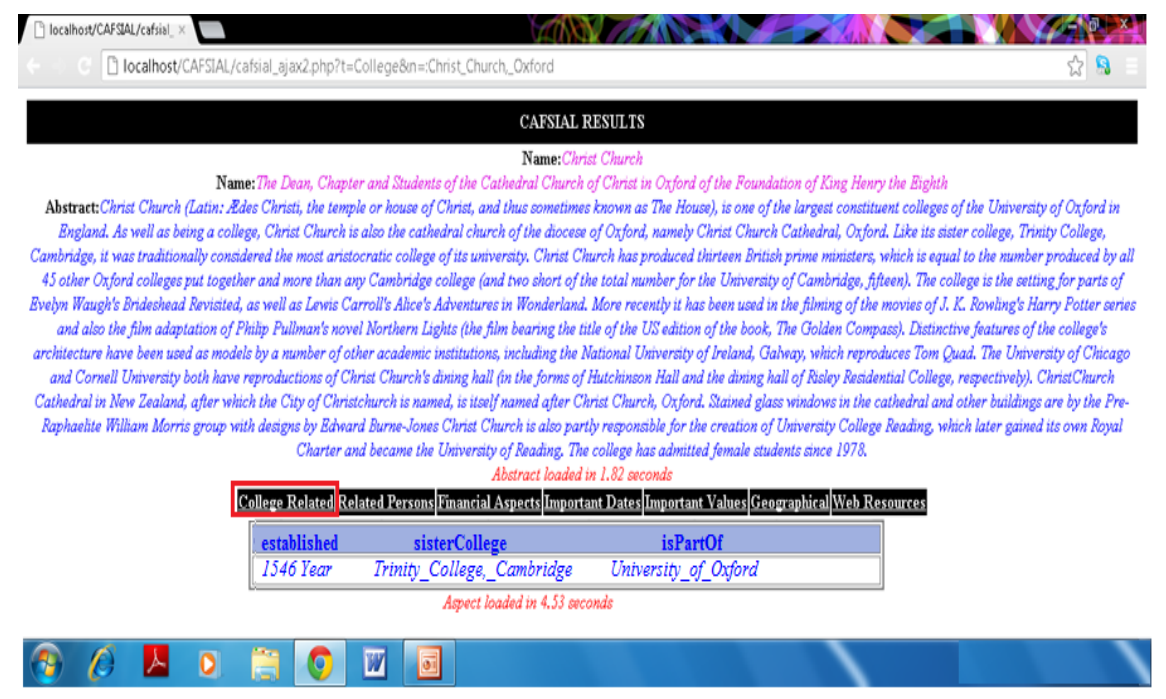
Figure 3. Screenshot of Result Presentation.

dump is being stored locally. This is notable improvement since the previous version of CAFSIAL was locally storing the DBpedia dumps. As the data is retrieved, at the same time similar properties are allied together to their relevant aspects using the already stored Domain and Range.